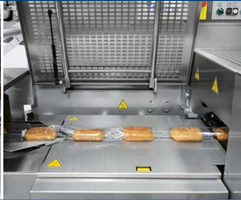
Bottom sealing unit

THE PANDA RED HORIZONTAL FLOW WRAPPING MACHINE IS A FLEXIBLE MACHINE THAT CAN FIND APPLICATION IN BOTH FOOD AND NON FOOD INDUSTRIES.