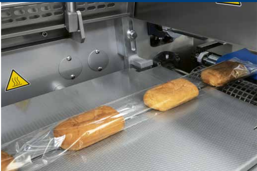
Bottom sealing unit