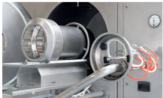
Changing drum 2 l