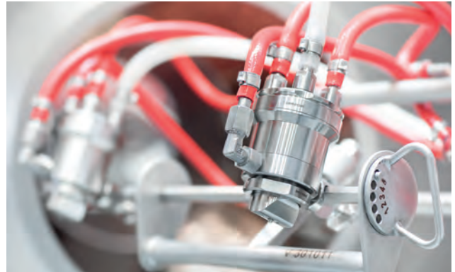
Glatt GCSD nozzle