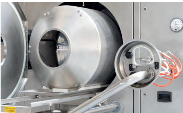
Changing drum 56 l